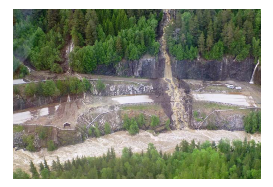
Fig. 3. Debris flow, such as over E6 in Rosten, Norway, may occur more often in a wetter climate

<u>Contracts</u> that are composed for a longer contract period (for example if construction and maintenance are included) must take into consideration climate change.