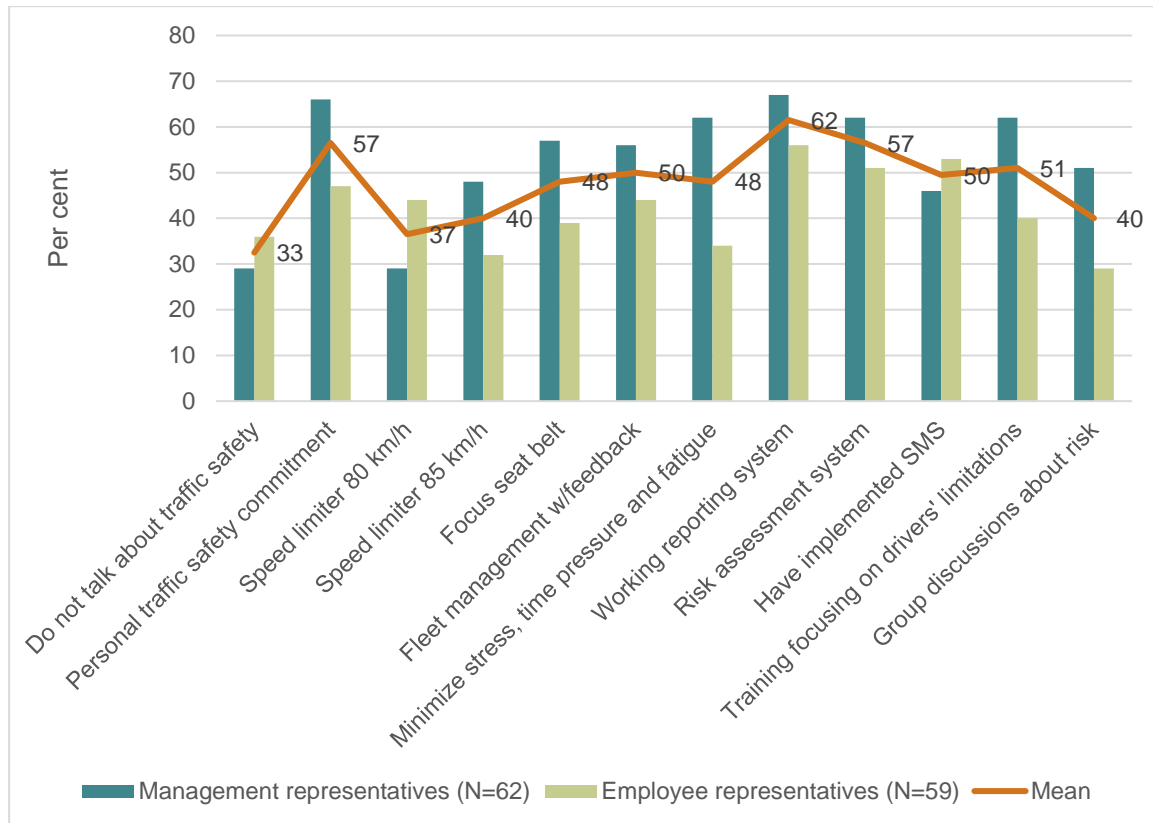
Figure S.3: Results from two surveys on the occurrence of 12 organizational safety management measures in Norwegian goods transport companies.

We have conducted two surveys to assess the occurrence of measures focusing on organizational safety management in Norwegian goods transport companies.